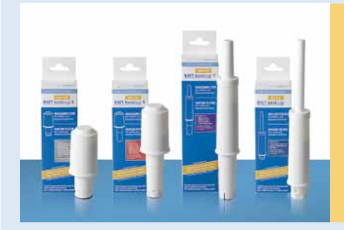
* Typical filter capacity at 10° carbonate hardness